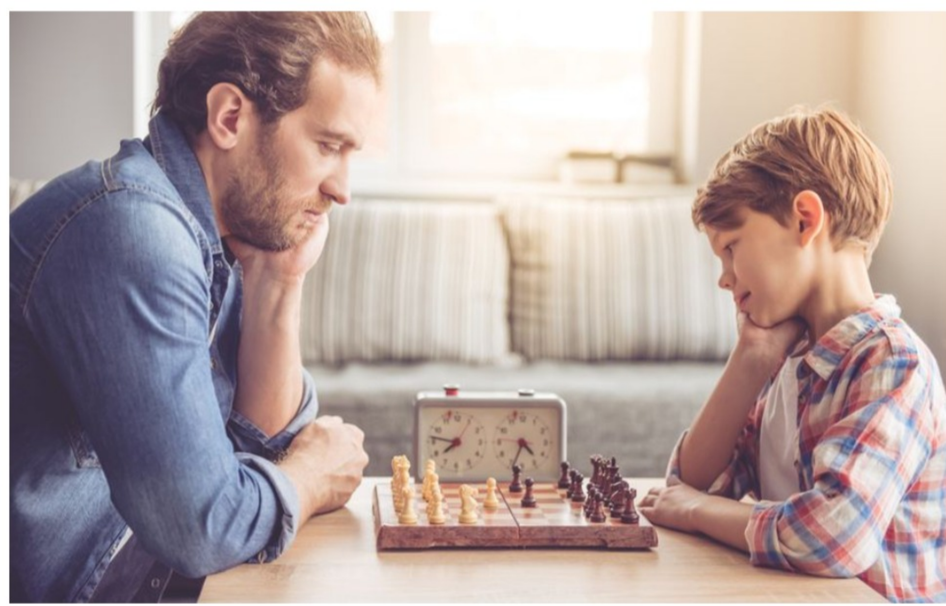
Kids benefit from playing games that help them improve their math skills. Chess teaches creative thinking and the ability to plan ahead.

Here are a few ideas to use at home to get kids thinking numerically.