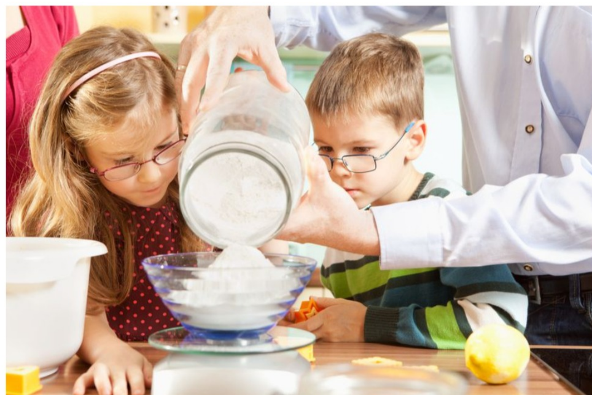
Baking from scratch involves lots of mathematical thinking: measuring ingredients for a recipe, multiplying or dividing fractions to bake a partial or double batch, and learning ratios and proportions.

Grocery store. Math is everywhere at the supermarket. Have your kids calculate the price per unit, weigh bulk items or produce, calculate percentage discounts and estimate the final price prior to checkout. Give them coupons to make the math more complicated. Very young kids can sort groceries into perishables, boxes and canned items to learn about categorization and counting. Talk about brand name versus store brand and comparison shopping. Send your teens to the store with a budget and your grocery list. (You're creating life skills for college for them, and a break for you.)